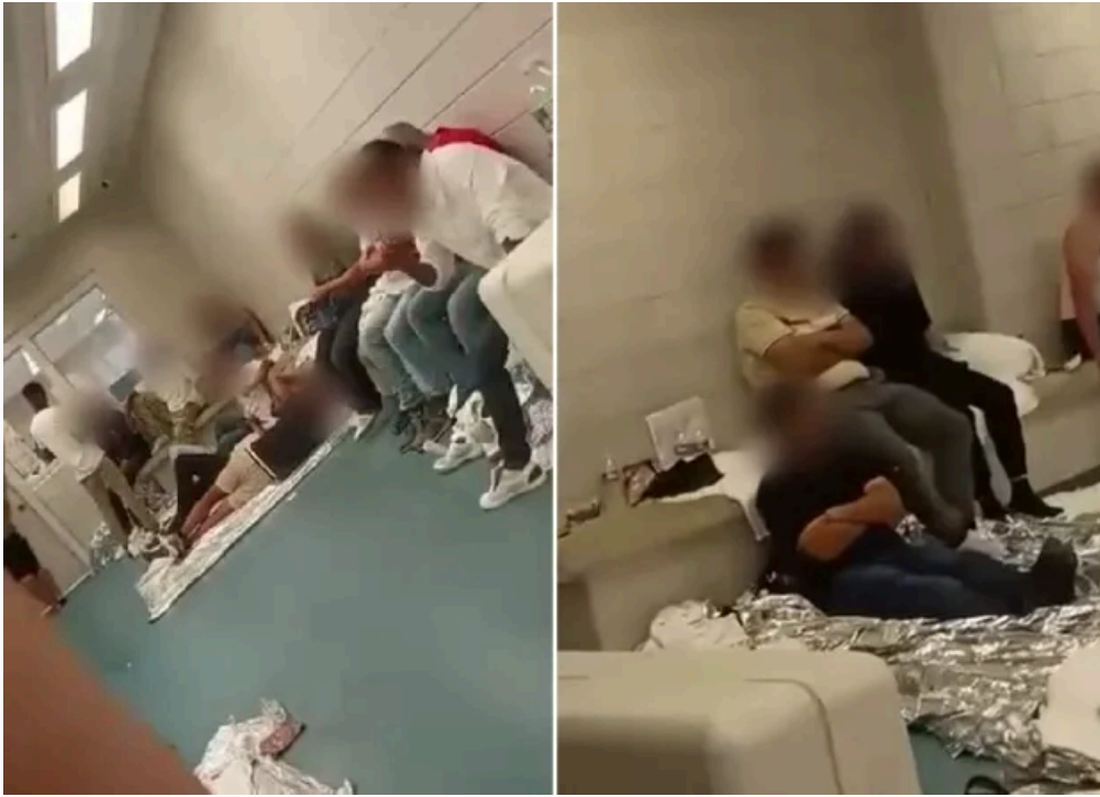
Video footage shows migrants being detained at 26 Federal Plaza in Manhattan, New York.

Lawyers for the American Civil Liberties Union, New York Civil Liberties Union, Make the Road New York and the law firm Wang Hecker LLP, who are representing the detainees, celebrated the order as a major victory for immigrants' rights, saying it imposed basic accountability on ICE at a time when migrants across the country are being denied constitutional protections on a daily basis.